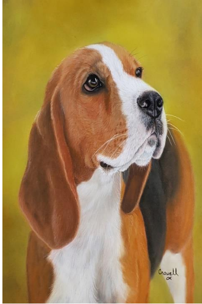
Are You Ready?