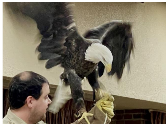
American Bald Eagle from the Eagles in Flight program.